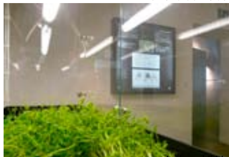
peas in the exhibition