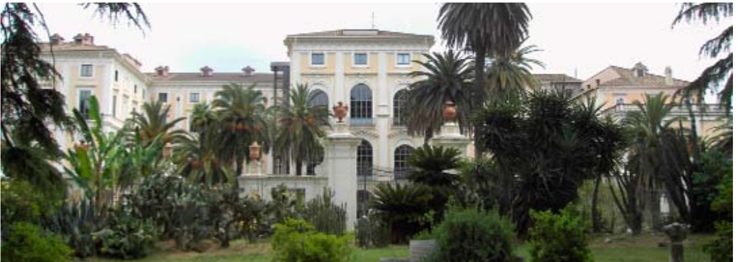
ROME, Botanical Garden and the Corsini Palace where workshop was held