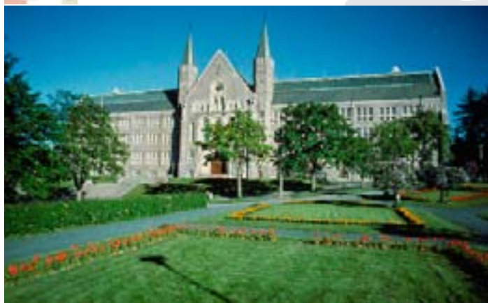
Norwegian University of Science and Technology, Trondheim, Norway