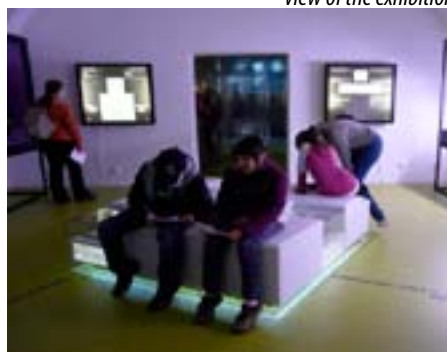
visitors in the exhibition

The catalogue, which can be purchased in Mendel Museum, creates a unit which fulfills every requirement of modern museology needs and, above all, the expectations of the most important critics – visitors from the general public.