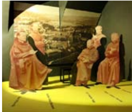
view of the exhibition