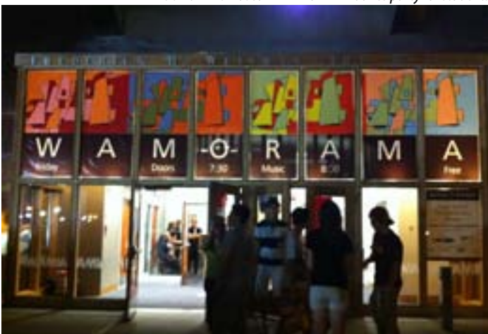
Weisman Art Museum WAMORAMA dance party for students