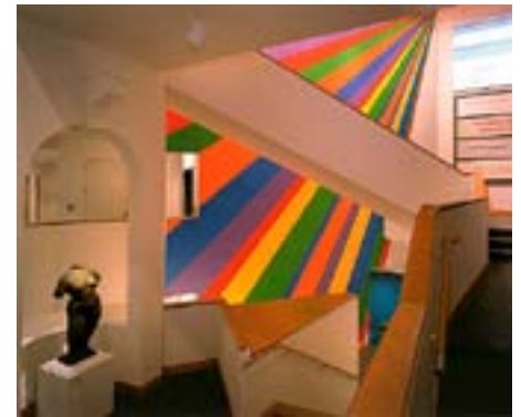
atrium of Williams College Museum of Art