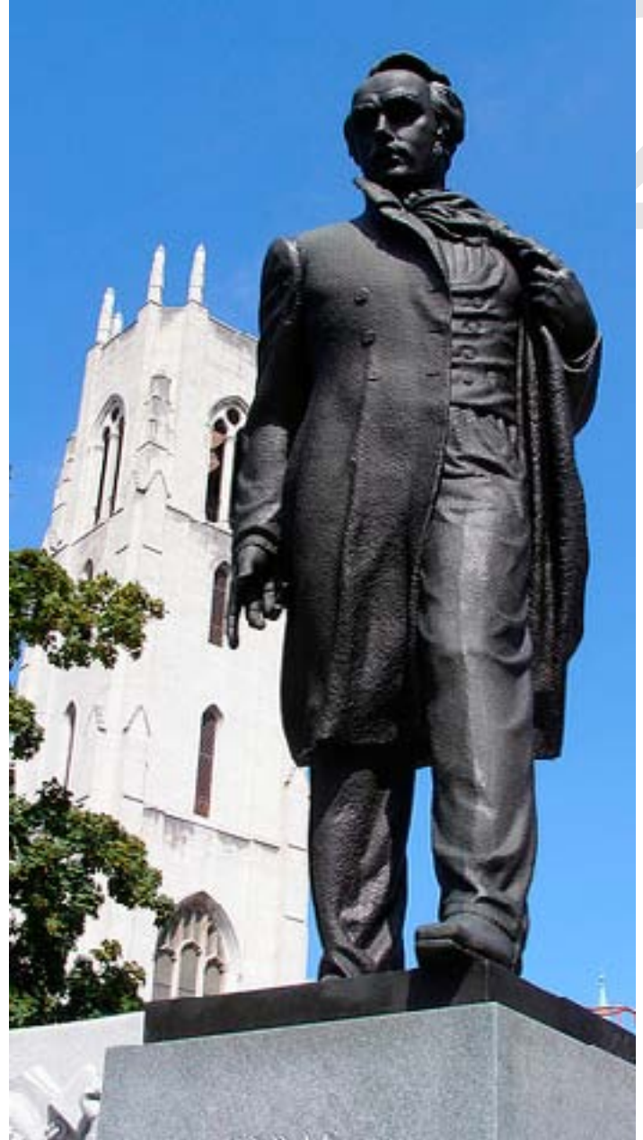
Monument to Taras Shevchenko, Ukrainian artist and poet in the 19th century, after whom the National University of Kiev is named. He was born as a serf and his poetry was censored by the Russian tsar because of its Ukrainian nationalist sentiments.