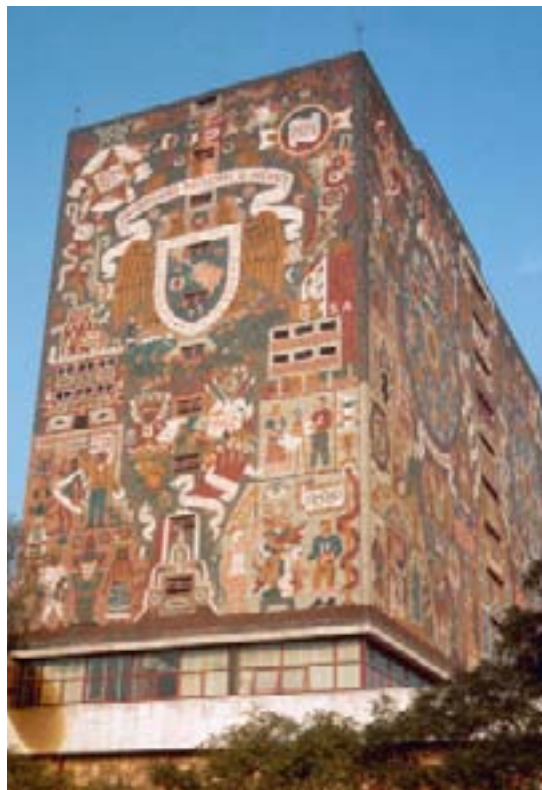
Mural by Juan O'Gorman (1904 - 1982 on the Central Library of the National Autonomous University of Mexico, 1952

So many subjects have been programed as: Museums' architecture, Museums' education, history of Museums,