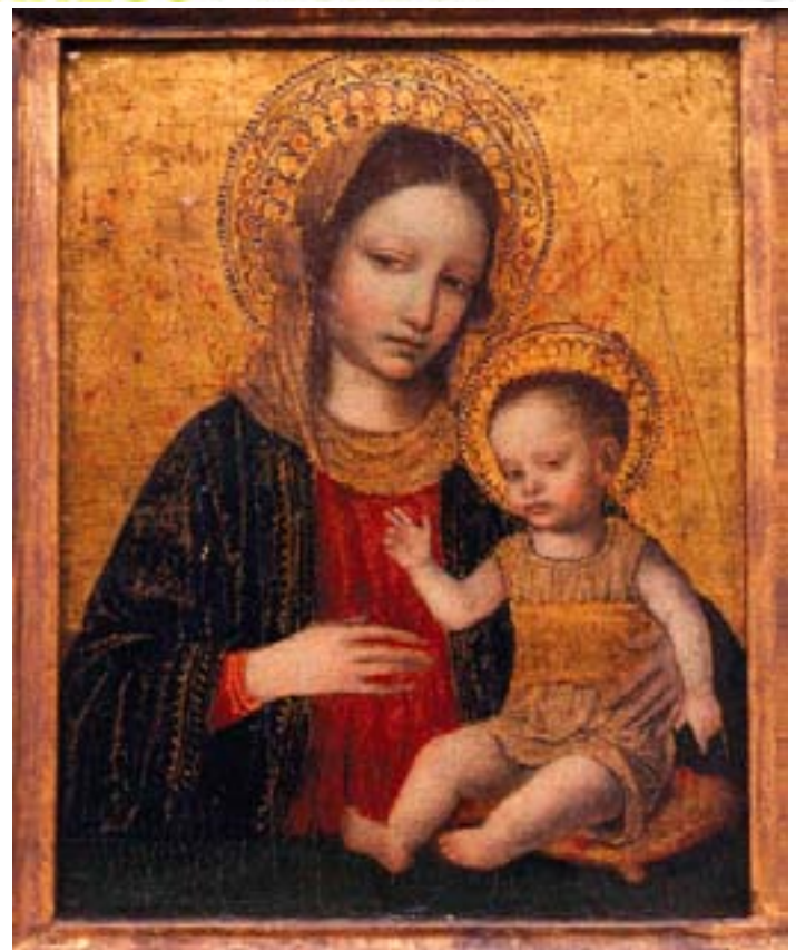
Ambrogio Borgognone (Milanese, ca. 1460–1523), Madonna and Child , 1490s, Tempera on wood, 11 1/4 x 8 3/4 inches, Georgia Museum of Art, University of Georgia; The Samuel H. Kress Study Collection, GMOA 1962.1896

"We are excited at the opportunity to demonstrate the continued