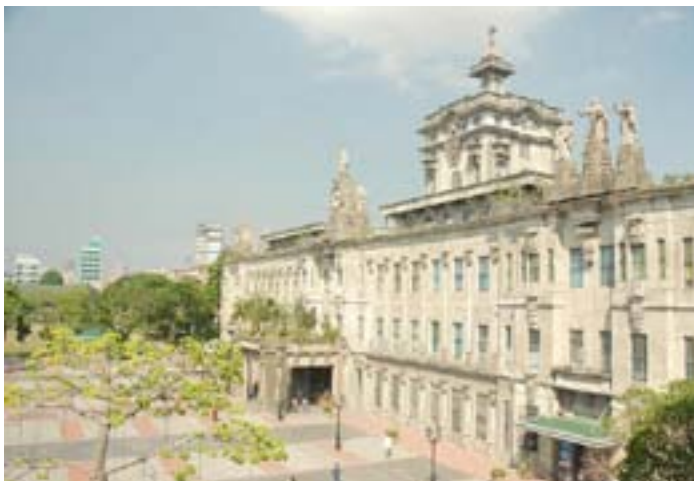
The UST Main Building, declared a National Cultural Treasure by the National Museum in 2010.