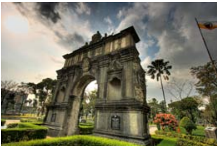
The original façade of the UST Main Building that originally stood in the Intramuros campus that was destroyed during World War II is now known as the Arch of the Centuries, another National Cultural Treasure.