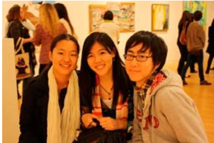
students at Georgia Museum of Art