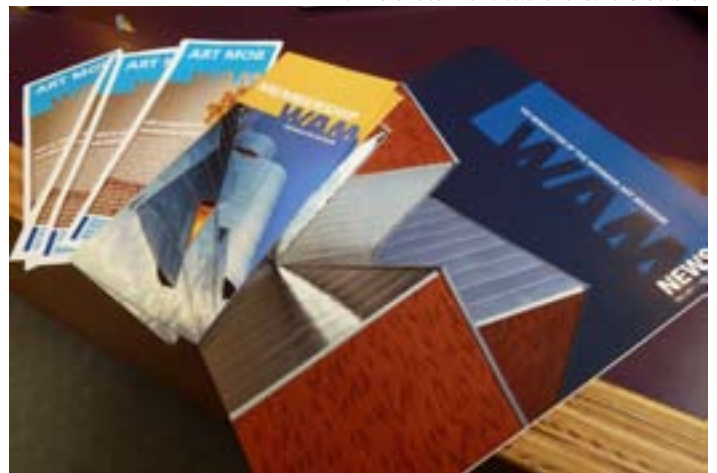
new "branded" newsletter and other brochures