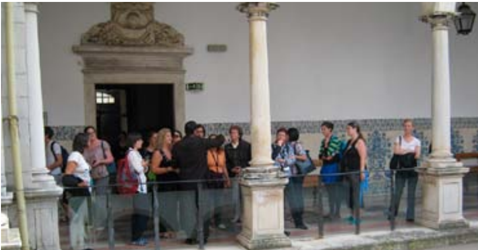
UMAC members in Lisbon at the 2011 conference

The conference is the time when UMAC has its annual general meeting. I keep going over in my mind the different ideas coming from people from five continents who were there, with all agreeing enthusiastically on the need to develop university museums and collections.