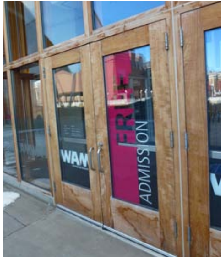
Above: aspects of WAM's new brand left middle: WAM west facade lit for gala opening below: WAM's expanded facility viewed from the north