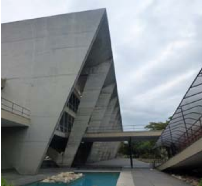
Museu de Arte Moderna in Rio de Janeiro