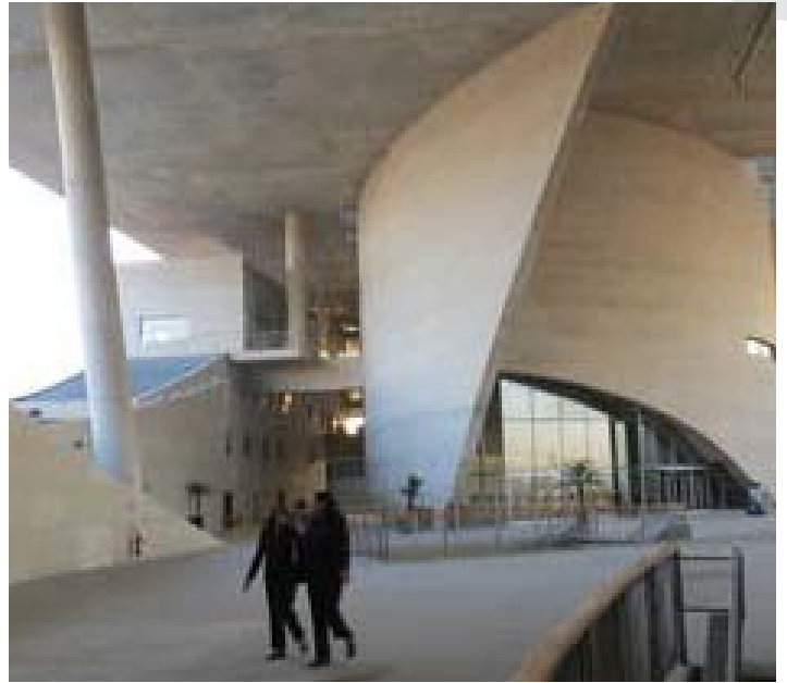
above: The conference center, Ciudad des Artes; below, decorative tile at Oswaldo Cruz