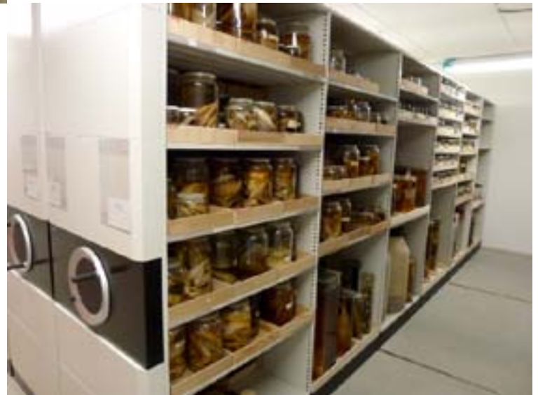
Zoological material in jars of different sizes.

Both museums have by tradition been important to the local community, for instance as meeting places for active and retired academics, museum workers, and amateurs from different branches of biology. In this respect they have played a significant role among non-professionals, often as a result of the encouragement and assistance of the museum staff and ex-professional biologists, by assembling a considerable amount of data on the distributions of, for example, insects and vascular plants. The acquisition of such information forms the basis for many current and forthcoming studies on biotic and environmental changes. Therefore the importance of the Biological Museums in Lund should not be underestimated since they are involved in numerous projects, such as local or regional botanical surveys, where amateurs and professionals work side-by-side and access to the collections is imperative.