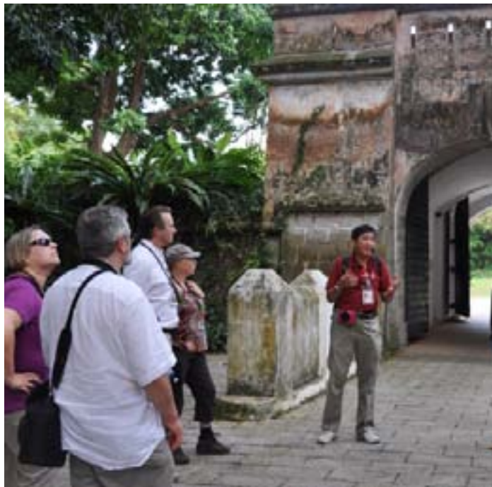
a post conference tour at Fort Canning.

As a platform for discussion and exchange, UMAC 2012 Singapore brought together a successful gathering of delegates, new and current. The next UMAC meeting is in Rio in 2013, in conjunction with the ICOM triennial meeting.