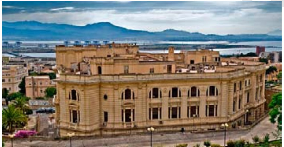
View of Palazzo Scienze and the Gulf of Cagliari from the site of the Roman Amphitheater

The main collections are exhibited in the Museo di Fisica, (Dept. Of Physics), in the Museo sardo di Geologia e Paleontologia "Domenico Lovisato" and in the Museo di Mineralogia "Leonardo de Prunner" (Dept. of Earth Sciences), in the Collezione degli Strumenti e Apparecchi di Chimica (Dept. of Chemistry and Geology), in the Museo di Zoologia (Dept. of Biology), in the Museo Herbarium (Botanic Garden), while the Museo Anatomico Clemente Susini, is hosted in the "Cittadella dei Musei".