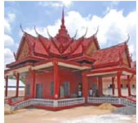
Prey Veng Museum