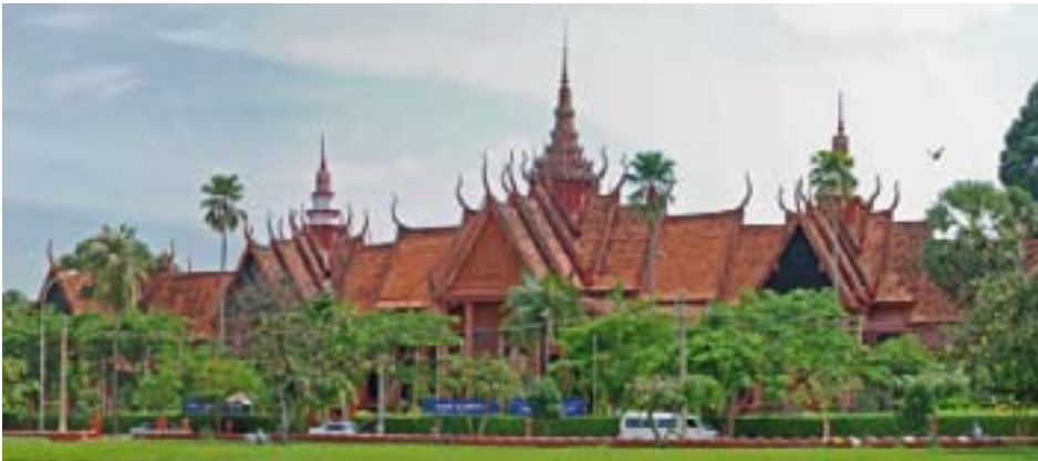
National Museum of Cambodia