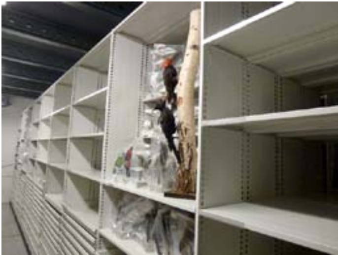
The bird collection is organized in systematic order.