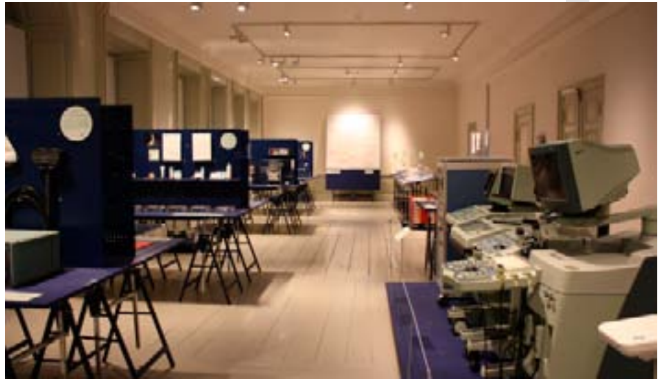
The exhibition "MEDICOTEKNIK – forty years of Danish biomedical engineering and innovation" at Medical Museion. The exhibition cases are placed on stylized work table in blue that mime the work situation of the biomedical engineer."

Many of the devices on display have emerged through collaboration between research institutions and companies, for instance the electromyographic (EMG) apparatus Nicolet Viking from the early 1980s, while the development of others was driven by user-demand, such as the Coloplast ostomy bag. The exhibition takes a close look at the work that goes into inventing, improving, and fine-tuning medical devices that ultimately aim to make life better for people.