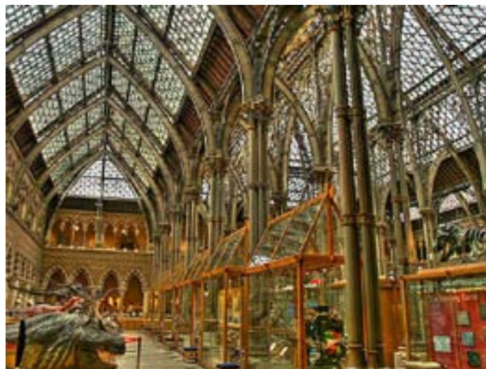
Oxford University Museum of Natural history