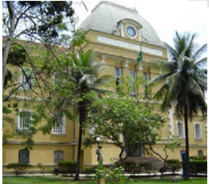
Museu de Astronomia e Ciências Afins (MAST)