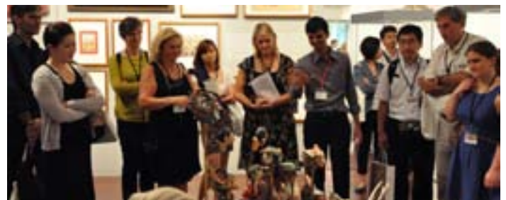
Delegates at a guided tour at NUS Museum

"Encountering Limits: The University Museum" was the main conference theme. The 3 day conference saw a total of 35 papers and six poster presentations, all of which were grouped according to themes relating to the practices, conceptual approaches and strategic positions adopted by university museums. Delegates were also treated to heritage walking tours which took them to places such as Palmer Road - Telok