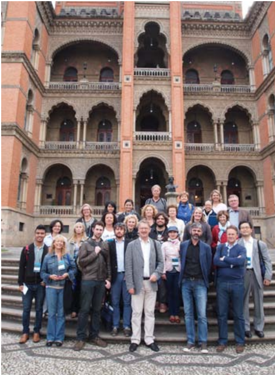
UMAC conference group outside the Oswaldo Cruz Foundation

waldo Cruz was conceived in 1986 as a center for research and documentation dedicated to the history of the Oswaldo Cruz Foundation. It later expanded its pursuits in science and health technology and today is active in education, information, and science communication, in addition to conducting research in a number of disciplines. The Casa currently preserves the most valuable share of Brazil's cultural heritage in the area of health, including collections that are landmarks of political, social, and cultural developments in health from as early as the late nineteenth century. It also offers Brazil's only graduate program in the history of the sciences and health, publishes História, Ciências, Saúde — Manguinhos , a quarterly scientific journal that enjoys a prestigious reputation within the Brazilian and international academic communities, and coordinates information networks in Latin America.