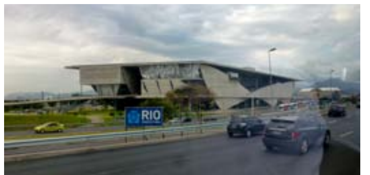
Immediately above: Conference Center, Ciudad des Artes; above, Conservation facility at Museu de Astronomia e Ciências Afins (MAST)