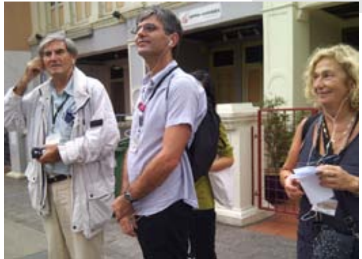
Desire Paths: Little India Audio Tour by spell#7, a local theatre company which creates intimate theatrical-sound performances and audio tours. Armed with headphones and mini MP3 players, participants were guided by two narrators as they told their stories, immersing themselves in the vibrant neighborhood of Little India.