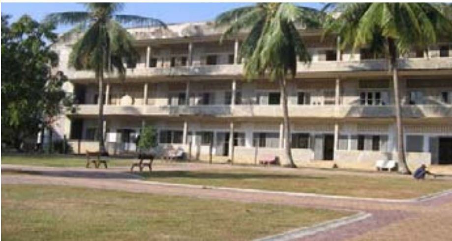
The Tuol Sleng Genocide Museum in Phnom Penh is a former high school which was used as the notorious Security Prison 21 by the Khmer Rouge regime from its rise to power in 1975 to its fall in 1979.