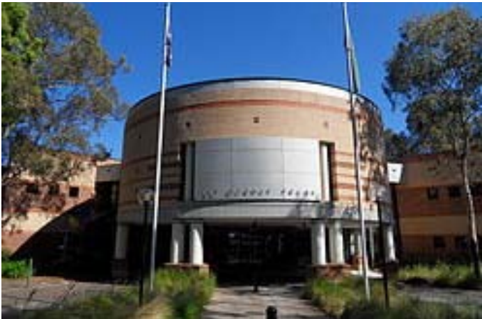
Art Museum, Macquarie University

Cultures) many students chose to complete their professional experience within these exceptional institutions. These University institutions have provided valuable real-world learning experiences for students while the students have provided valuable, voluntary assistance to these campus institutions. To date there have been approximately 50 individual projects done by students in our on-campus museums, ranging from registering collections, curating exhibitions and designing education programs to undertaking audience studies and designing marketing campaigns.