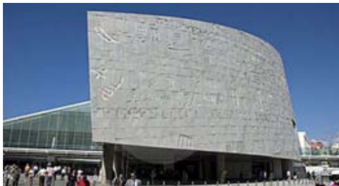
The “new” library at Alexandria

Alexandria has an international airport (hubs are Istanbul or Athens) and many flights from the Middle East. There is also a connection through Cairo by Egypt Air. Alexandria is the second largest city in Egypt, after Cairo. Alexandria was founded in about 331 BCE by Alexander the Great. It became an important centre of Hellenistic civilization and remained the capital of Hellenistic and Roman and Byzantine Egypt for almost one thousand years until the Muslim conquest of Egypt in ACE 641. Hellenistic Alexandria was best known for the Lighthouse of Alexandria (Pharos), one of the Seven Wonders of the Ancient World and its Great Library, the largest in the ancient world. The library was part of a larger research institution called the Musaeum of Alexandria, where many of the most famous thinkers of the ancient world studied. The ancient library was destroyed by fire. A new library was officially inaugurated in 2002. An architectural design competition, organized by UNESCO in 1988 to choose a design worthy of the site and its heritage, was won by Snøhetta, a Norwegian architectural office, from among more than 1,400 entries.