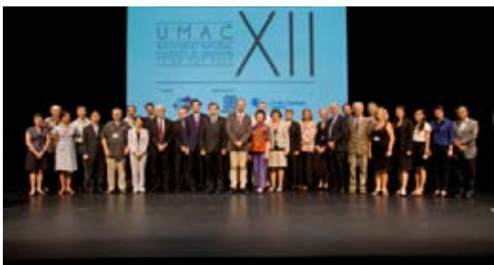
Participants in UMAC Conference in Singapore

Desire Paths: Little India Audio Tour by spell#7, a local theatre company which creates intimate theatrical-sound performances and audio tours. Armed with headphones and mini MP3 players, participants were guided by two narrators as they told their stories, immersing themselves in the vibrant neighborhood