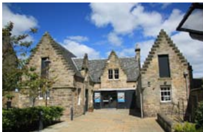
University of St. Andrews museum

by neil curtis > This was a very successful conference that attracted 80 delegates from across Europe to focus on the role of museums in academic research and how it can be fostered and managed. Questions addressed included how links can be fostered between researchers, students and museums; the role of museums in developing funded research projects; the development of local, national and international research partnerships and collaborations; the role of museums in public engagement with research; whether museums based in academic institutions have a special role; and the place of museum staff as researchers.