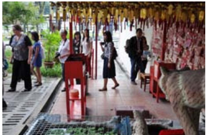
Reading the Cosmopolitan Layers of Singapore, a heritage walking tour which covered the Palmer Road area, one of the oldest cosmopolitan settlement in early 19th century Singapore, retracing the former coastline of the bay along Telok Ayer towards Singapore River.