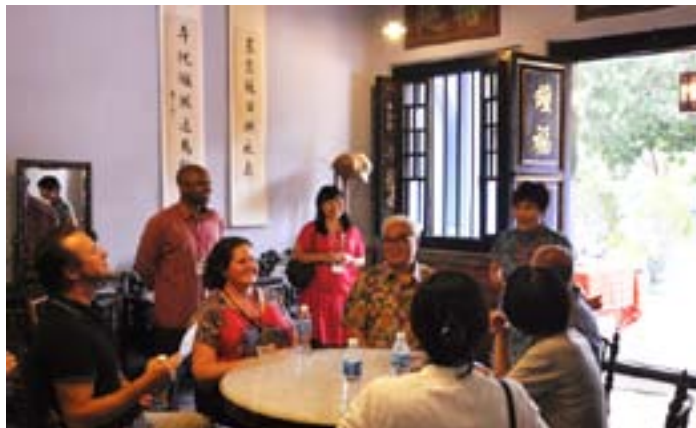
NUS Baba House and Neil Road Heritage Tour, where delegates were introduced to the neighborhood gazetted as the Blair Plain Conservation Area and also the NUS Baba House, a heritage house formerly owned by a Straits Chinese family.