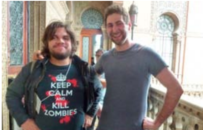
Two young UMAC members at Oswaldo Cruz Foundation