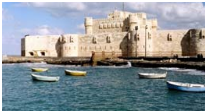
Fort Qaitbey is located at the spot of the legendary lighthouse of Pharos.