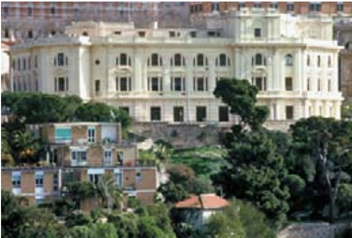
View of Palazzo Scienze from the South

on by Master and Doctoral research, is to conceive a new museum whose aim and mission should be clearly declared in its architectural features, purpose being the exhibition of the scientific collections of the University as a base for a contemporary Science Centre, that could meet the needs and curiosity of anyone wanting to approach to science.