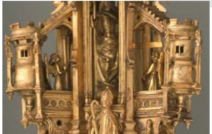
St. Salvador's Mace at University of St. Andrews Museum

Changes in the governance and management of museums were also discussed as being necessary to embed the role them in the mission of their host universities, though this might involve increased scrutiny and challenge the expectations and practices of many staff. In particular, the need for museums to play a role as a nexus of collaboration, rather than as isolated islands of expertise was highlighted, with links with academics, students, communities and other museums discussed. The relationship between museums and research was therefore moving from one in which it existed as a core function of museums to one in which museums could play a role as a core function of research institutions. The role of organisations such as UMIS, Universeum and UMAC were seen as critical to help support these networks, with a challenge being how we could move from talking to each other to working with each other.