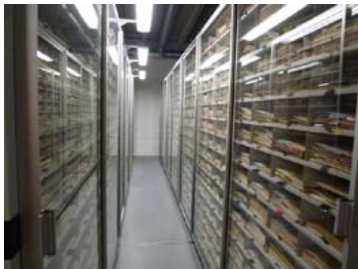
The new compact cabinets for botanical specimens comprising 48800 trays.

The Biological Museums at Lund University, constituting an administrative amalgamation of the Botanical Museum (BM) and the Museum of Zoology (ZM), were formed between 2002 and 2009 as a separate unit of the Faculty of Science. From 2010, the museums were incorporated into the new extended Department of Biology http://www.biomus.lu.se/ During the last few years, we have seen a dramatic increase in external