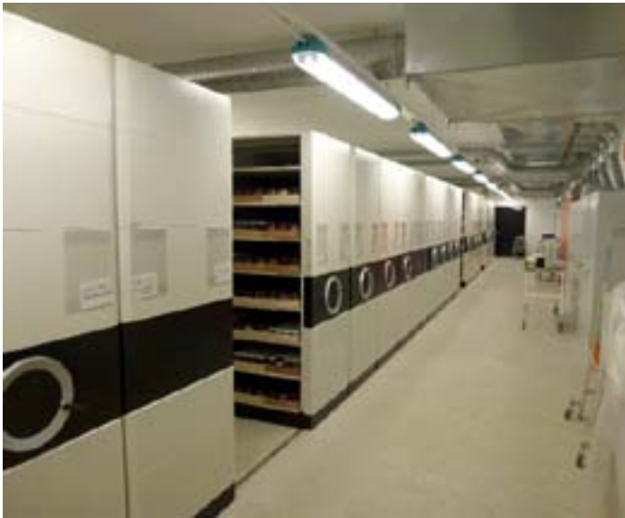
The separate storage room with modern compact cabinets for zoological material preserved in alcohol.

The Biological Museums are primarily responsible for preserving and documenting the collections, making them available to the scientific community, and providing pertinent information to various governmental and other agencies and decision makers. To fulfil this responsibility, the Biological Museums have in recent years given high priority to, and put a large effort into, developing searchable databases, thereby becoming a link in a worldwide network of natural history collections. http://www.biomus.lu.se/botaniska-museet/databaser , http://www.biomus.lu.se/zoologiska-museet/databaser . The significance of the combined botanical and zoological collections to the international scientific community is enormous, as demonstrated by the large number of loan requests and the papers, based wholly or in parts on material belonging to the museums, published by researchers worldwide. Nationally the collections are extremely important, particularly in the context of the Swedish Taxonomic Initiative (Science 307: 1038-1039).