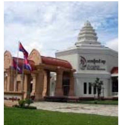
Angkor National Museum