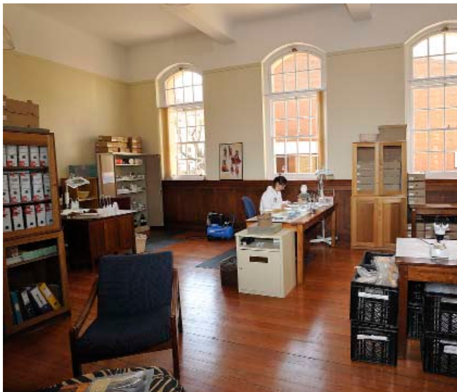
The new conservation lab at the University of Pretoria

The facility also has close ties with various academic departments, in particular the Department of Anthropology and Archaeology, whose students receive hands-on practical training at the facility. Students help out on a voluntary basis, documenting finds and helping with cleaning and research. In this way, they also see how important it is to protect the integrity of finds on-site, and gain insight into the full circle of an object: from its initial discovery to its eventual display in a collection.