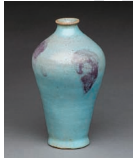
Chinese, "Soft" Junyao Vase (Meiping), Yuan Dynasty or Ming Dynasty, 14th-15th century Glazed earthenware, 4 7/8 x 3 x 3 in. (12.4 x 7.6 x 7.6 cm.), Museum Purchase, funds provided by the David A. Cofrin Art Acquisition Endowment