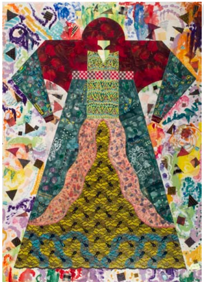
Miriam Schapiro (American, born 1923), Costume for Mother Earth , 1995, monoprint with collage, 77½ x 56½ inches MSU purchase, funded by Robert D. Spence, 2000.37

ACUMG also sponsors annual conferences. The 2009 Conference