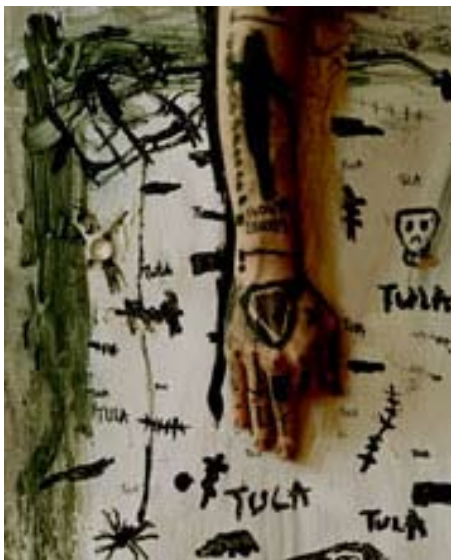
Saul Fletcher, Untitled # 158 (Tula) , 2004, C-type print, 5 1/2 x 4 1/4 inches, Courtesy Anton Kern Gallery, NY.

Join the Rose Museum email list at https://lists.brandeis.edu/www/subrequest/roseart