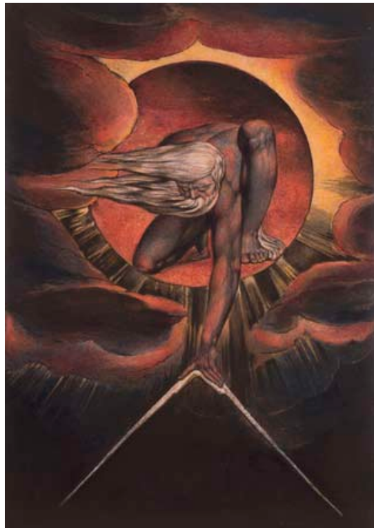
William Blake, Europe Plate I: Frontispiece, The Ancient of Days , Collection, Whitworth Art Gallery, University of Manchester

In conclusion, the conference was never about simply teaching delegates the basics. It illustrated that university museums are doing cutting edge work in this field but also interrogated current practice. In this way it was a chance to find shared ground, develop frameworks for improving and enhancing our performance and to collectively raise the bar on community engagement.