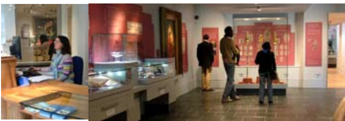
new galleries at Musa