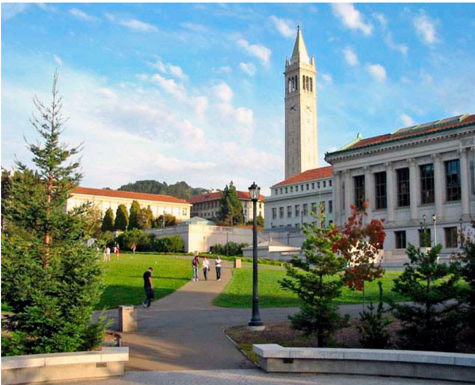
University of California, Berkeley