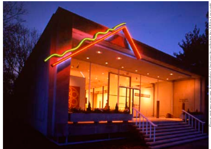
Rose art museum, brandeis University

If you are interested in keeping up with the threats of museum closing or collection sales, the North American organization, the Association of University Museums and Galleries listserv often has information. ACUMGL-subscribe@yahoogroups.com . Also, check http://groups.yahoo.com/phrase/museum-associations for information on other groups you can join for information.