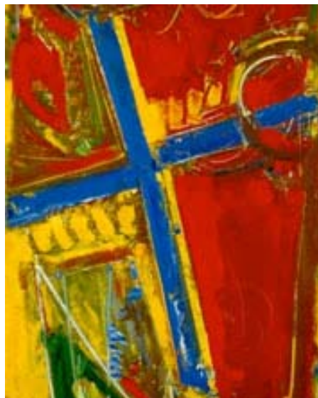
Sketch - Chimbote Mosaic Cross , 1950, Oil on panel: 84 x 35 - 3/4 inches. 213 x 91 cm, Courtesy of the Renate, Hans and Maria Hofmann Trust.