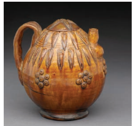
Chinese, Melon-form Ewer with Amber Glaze and Applique Decoration, Liao Dynasty (916-1125), 10th century Glazed stoneware, 5 x 4 1/4 x 4 1/4 in. (12.7 x 10.8 x 10.8 cm.) Museum Purchase, funds provided by the David A. Cofrin Art Acquisition Endowment