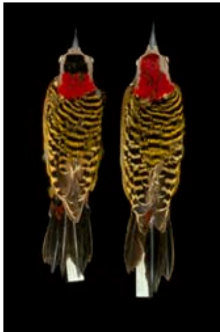
from the collection of the Museum of Vertebrate Zoology at the University of California, Berkeley http://mvz.berkeley.edu/Bird_Collection.html