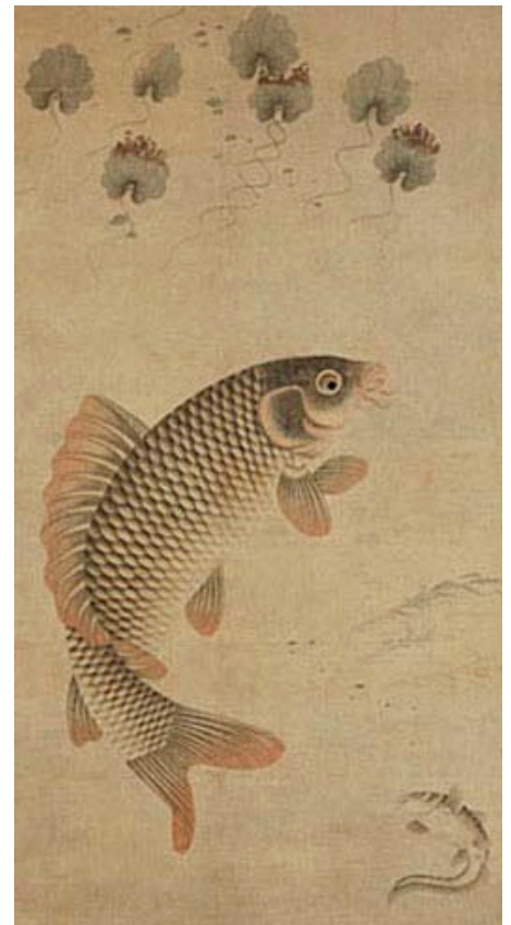
Unknown; tradition of Miu Fu (15th century); Fish and Water Plants; 15th century; Hanging scroll: ink and color on paper; 27 x 14 1/4 inches; Collection the University of California, Berkeley Art Museum, purchase made possible through a gift from an anonymous donor; 2002.1.5

CHECK OUT UMAC'S WEBSITE AT HTTP:// PUBLICUS. CULTURE.HU- BERLIN.DE/ UMAC/