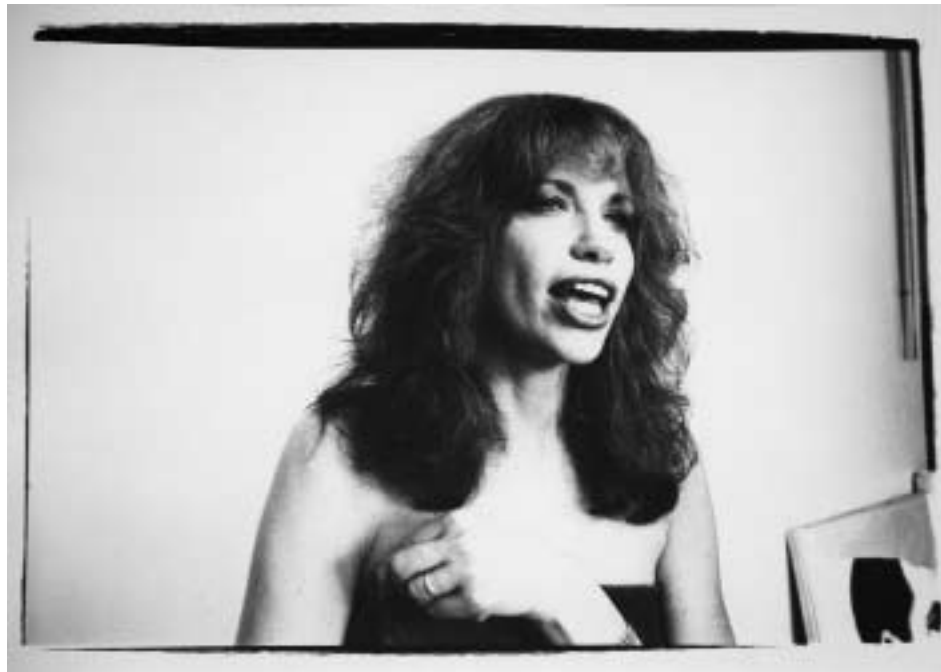
Carly Simon, n.d., Gelatin Silver Print, Gift of the Andy Warhol Foundation for the Visual Arts