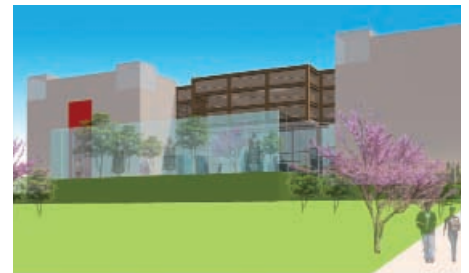
Architect's rendering of new Asian wing