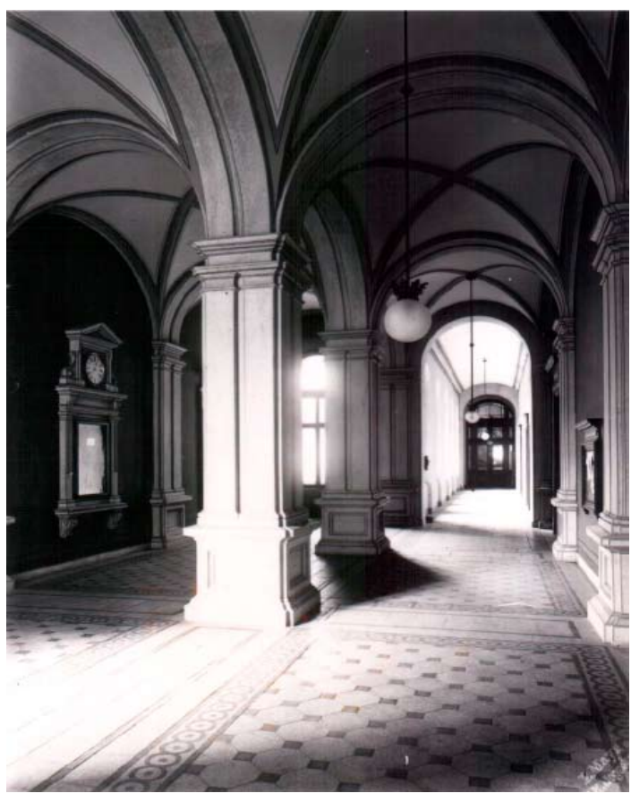
Above: director's house Below: Foyer of Theatrum Anatomicum