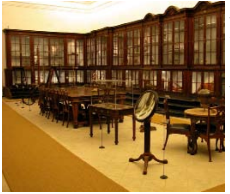
Above, below and right: Views of the Museum

Another transformation took place in the second half of the 19th century when the Natural History Museum expanded to rooms left vacant by the transfer of the hospital to another building. This had major implications in the lessons and collections during the process of specialization of disciplines.