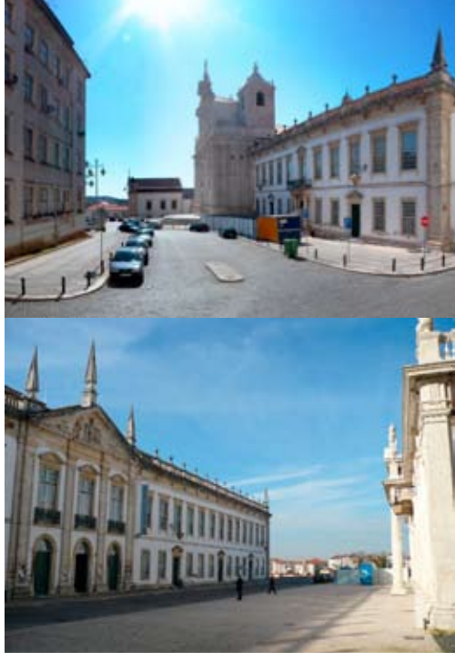
Above: Schematic view of campus Center and Bottom: Views of campus