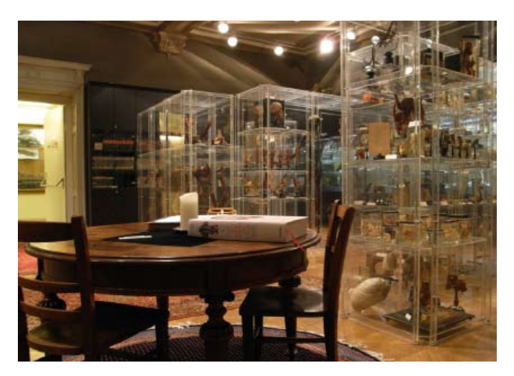
Above: Anatomical Theater Below: Anatomical Museum Right: Painted Skull from the mountains of Austria in the Museum collection