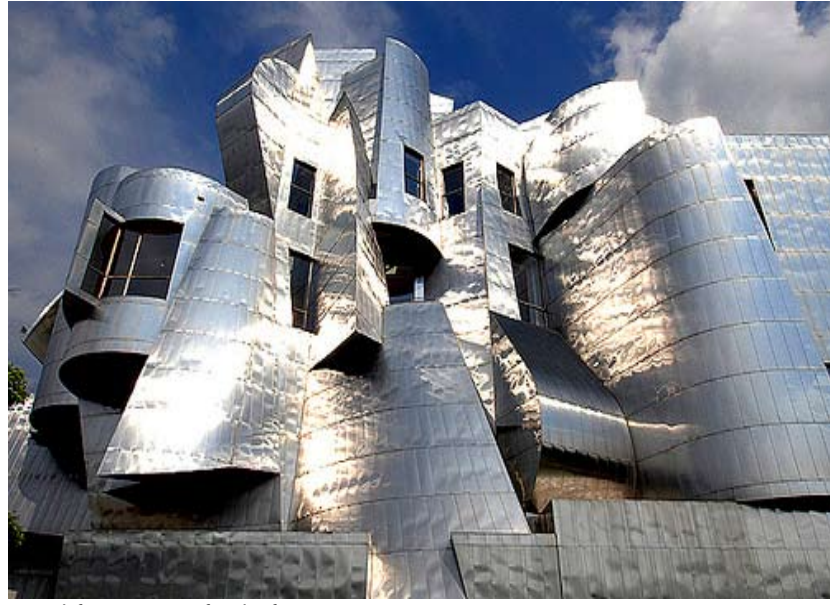
Lower left: current west facade of museum Above center, model of expanded museum from notrh west Top: diagram showing new spaces