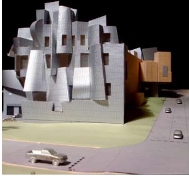
Lower right, model of west facade after expansion Above right: model of expanded museum from south