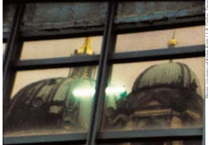
Tacita Dean, British, b. 1965 Palast, 2004, Six color photogravures, 19 5/8 x 27 1/2 in. each

The exhibition is made possible by the Andy Warhol Foundation for the Visual Arts; the C. Frederick and Aase B. Thompson Foundation; Étant donnés, the French-American Fund for Contemporary Art, a program of the French-American Cultural Exchange; the John Early Publication Endowment; the Sidney Knight Endowment; and the Harn Program Endowment. For additional information about the exhibition or related programs visit www.harn.ufl.edu.