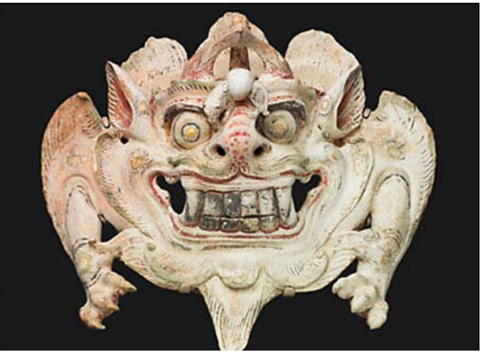
Large Pushou Monster Mask.' Chinese; Tang dynasty, early 8th century. Molded white earthenware with cold-painted pigments, gold leaf, and silver leaf, Harvard University Art Museums

UMAC and CIPEG are currently inviting submissions for oral