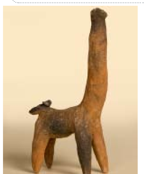
Ceramic figure from the Mapungubwe Museum collection