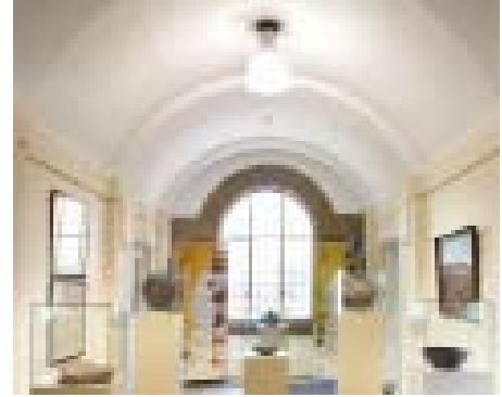
View of interior of Mapungubwe Museum