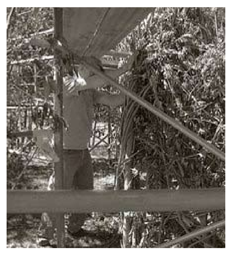
Patrick Dougherty is known for his woven sapling site-specific installations. Stacks of cut saplings under nearby trees are kept wet so the twigs stay pliable and ready for use.