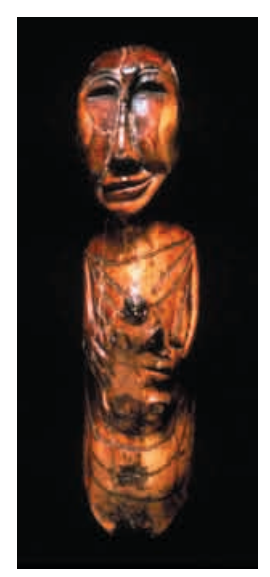
The Okvik Madonna, a 2,000year-old ivory carving, is featured in the "Highlights" section of the art gallery.

In this new gallery, Alaska's art takes center stage. A freestanding exhibit case of Alaska Native clothing and tools greets visitors when they walk through the entry way. To the right, exhibit cases lining the walls showcase the museum's oldest art pieces--ancient ivory carvings and other artifacts from the museum's archaeological collections.