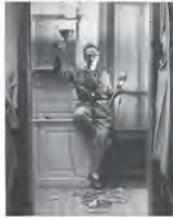
Autoportrait aux flashes, Paris, 1951

Willy Ronis, Autoportrait aux flashes, Paris, 1951 © 2009 by the Center for International Photography at the University of Maryland / Smithsonian AP © December 1989. Ronis