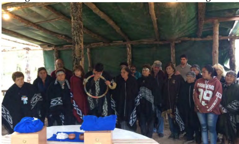
Figure 4. Return of Gherenal and Indio Brujo (see urns and offerings) from Tapalqué to Santa Rosa by representatives of the Consejo de Lonkos de la Nación Rankel.

Another important shift that the case presented here has encouraged was the improvement of communication. External communication with the community in general (both actual and potential visitors) was equally important, to allow further transparency regarding decisions on restitutions and scientific collections management. Regarding internal communication, the Museum recognized the need to include seminars about restitution during the training of Museum guides. For other activities, in contrast, the Museum did not promote any. Thus, as personal initiatives teaching and outreach activities about the history of Anthropology, collections, museums, Indigenous rights, and restitutions were addressed to Anthropology and Archaeology students, PhD students, researchers, and museum workers in order, first of all, to revisit the history of physical and biological anthropology and its dependence on the acquisition and handling of human remains – aspects that are nowadays disregarded in the training of biological anthropologists (LINDEE & SANTOS 2012). Secondly, to introduce ethical and social implications of daily life in a research team; and, thirdly, to promote changes to the disciplinary practices of future generations. The need for the implementation of effective internal communication strategies also became apparent to understand different opinions, the reasons for resistance to political changes, and aspects that entail further debate and consideration.