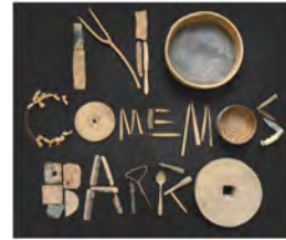
Fig. 3. Art installation with the tools of the Murciego potters, artwork by Pepe Murciego, 2021. Next to it, a tip jar made by the Murciego potters in 1973.