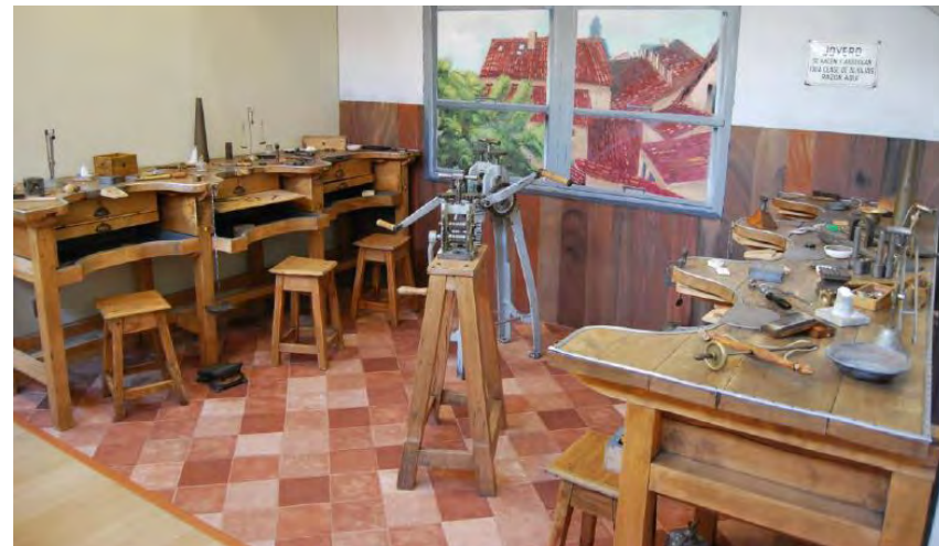
Fig. 4. Jeweler workshop display at Museo de Artes y Tradiciones Populares.