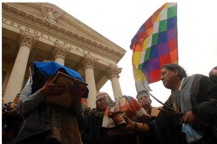
Figure 3 (a, b). Return from the Museum of La Plata to Trenque Lauquen and Tapalqué