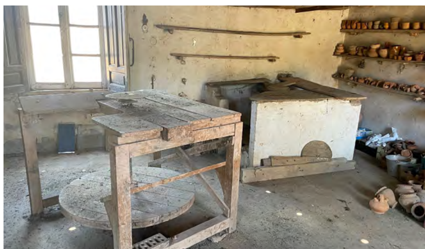
Fig. 1. Pottery workshop in Segovia, Spain.

These are just a few examples that the Museo de Artes y Traditions Populares has successfully used and that could be applied by many other institutions. Each one has needed a different approach to the challenge posed and flexibility for both parts. Understanding the needs of the community and rethinking the museum's purpose are essential parts of the process. Close contact with the communities not only makes the museum's daily work easier and more interesting but gives meaning to the preservation and dissemination of this very special cultural heritage. These are fundamental values that underpin the entire purpose of the museum's existence.