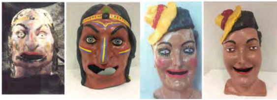
Fig. 2. Bigheads from Graus, restored in Museo de Artes y Tradiciones Populares