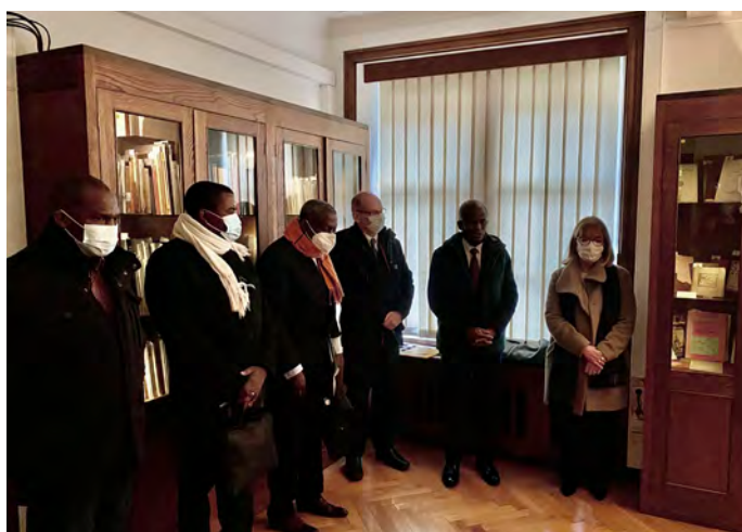
Figure 2. The rectors of UNILU and ULB and delegations paying tribute to the 14 deceased

Upon completion of her doctoral thesis, the ULB commissioned Gonissen to continue her analysis of the ancestral remains held at the ULB, and to complete the analysis of the fourteen skulls involved in the restitution agreement, as well as other skulls in the osteological collection. The results of her research were communicated in September 2024. She concludes that, among these fourteen skulls, only eight really originate from Congo, but that three other skulls, which were not mentioned in the restitution agreement, also probably do. Her research allowed her to identify the donors (or sellers) of these ancestral remains, as well as the ethnocultural or geographic origins of ten of these eleven skulls, showing that they came from different places