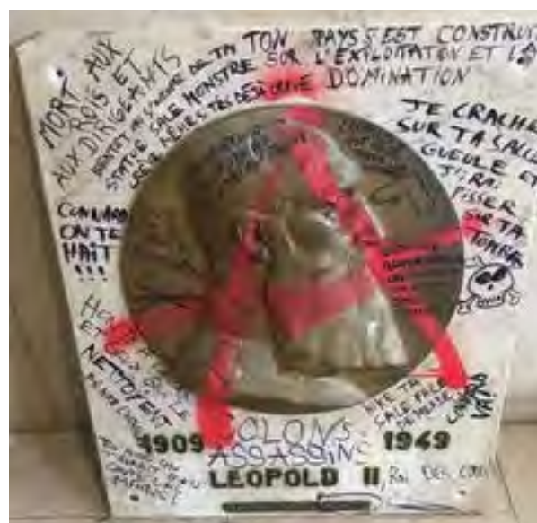
Figure 1: Picture of the Leopold II medallion covered with graffiti

At ULB, the issues related to the medallion in honor of King Leopold II and the colonial collection of ancestral remains - but also, of course, the mobilizations of decolonial movements within and outside the university - have stimulated reflection and initiatives related to the history of colonialism and its current repercussions. Thus, an analysis of the university's archives was carried out, leading to an inventory of resources available for further research; a contemporary history seminar was devoted to colonial memories; the interdisciplinary research project - history, sociology, anthropology - HERICOL 24 (colonial heritage) was created within the ULB; as well as the project "Décolonisons-nous!" 25 (Let's decolonize!). With the change of rectorship, a permanent "Colonial Heritage and Decolonization Steering Committee" was created and approved by the Academic Council of the university in 2021. It is chaired by the Vice-rector in charge of International Relations and is composed of representatives of the